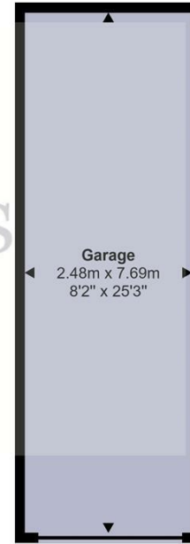
Garage Approx 19 sq m / 205 sq ft

This floorplan is only for illustrative purposes and is not to scale. Measurements of rooms, doors, windows, and any items are approximate and no responsibility is taken for any error, omission or mis-statement. Icons of items such as bathroom suites are representations only and may not look like the real items. Made with Made Snappy 360.