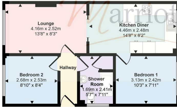
Floorplan Approx 45 sq m / 485 sq ft